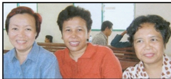
Praise God for Christians such as these!

Held in detention awaiting trial, these women showed joy and calmness despite drunken prison officers who often beat the prisoners. Ordinary Indonesian housewives – a Chinese, a Batak and a Javanese – they hope their case will change the law and there will be an investigation into the difficulties Christians face in the building of churches.